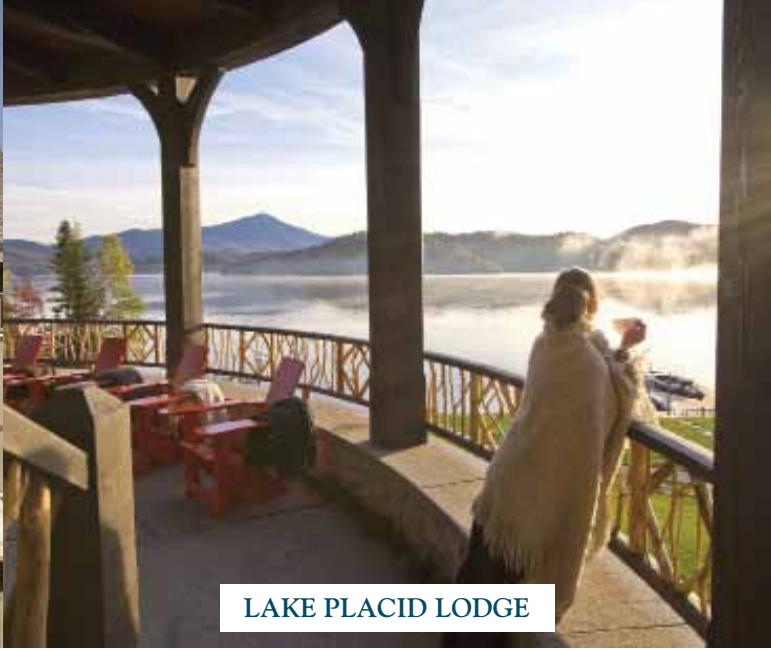
LAKE PLACID LODGE

Stroudsburg tree lighting. Do the jingle bell rock with Fido alongside as the spirit of the holidays begins.