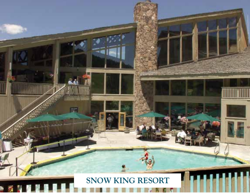
SNOW KING RESORT