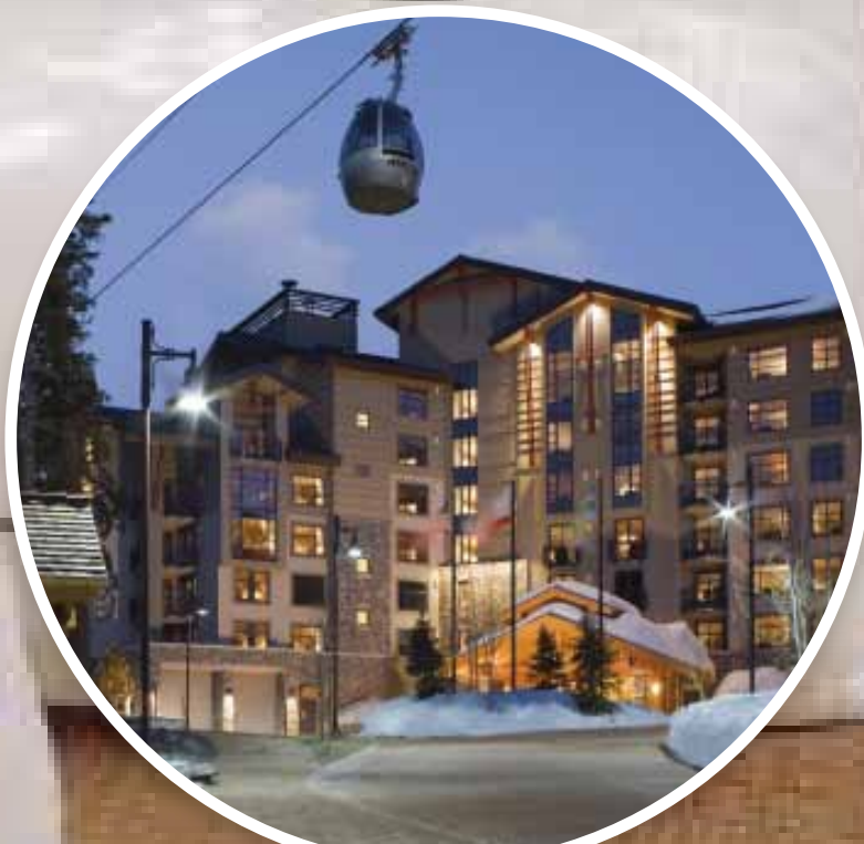
WESTIN MONACHE RESORT