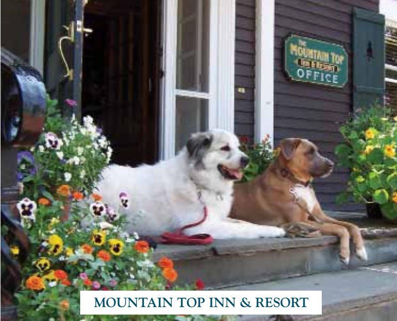
MOUNTAIN TOP INN & RESORT