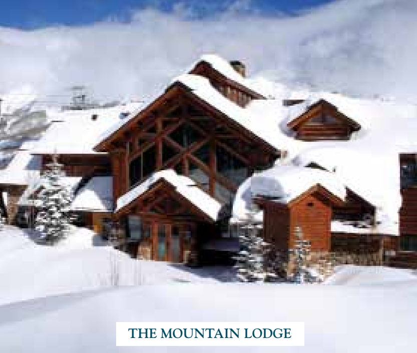
THE MOUNTAIN LODGE